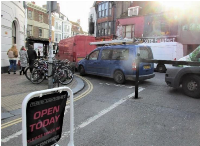
Gate and parking at Ship St. / Duke St. junction. Looking south.