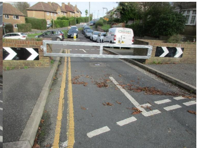
Permanently locked gate at Dewe Road / Natal Road junction looking north. This is a cycle route.