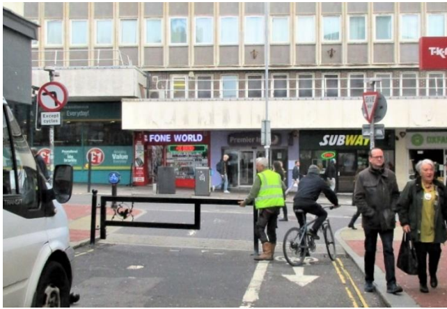
Gate at Ship St. / North St. junction. Looking north.