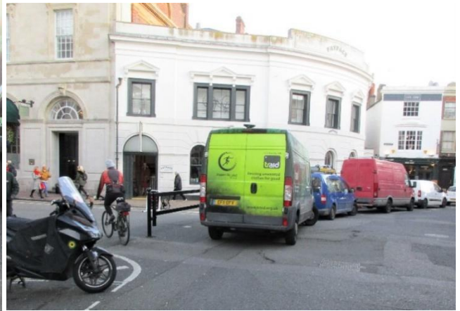
Gate and parking at Ship St. / Duke St. junction. Looking east.