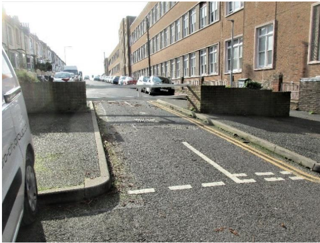
The gate at Natal Rd. / Dewe Rd. junction, looking south.