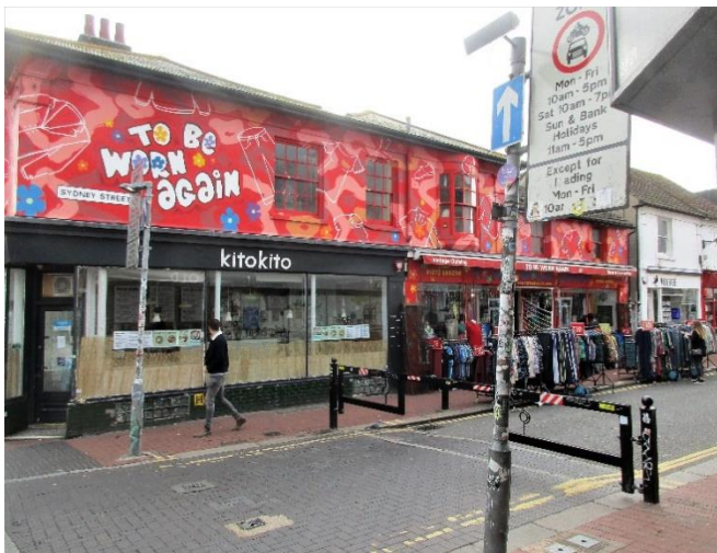
It is legal to cycle southbound along Sydney Street, but this gate at the northern end blocks the route.