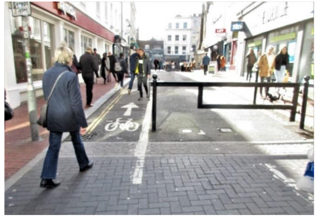
Gate at Ship St. / North St. junction. Looking south.