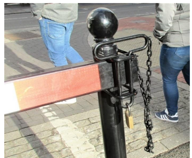
Friendly infrastructure? Intrusive metal lock and chain at Ship Street at child height.