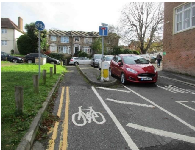
Natal Road cycling facility, eastbound leading to Dewe Road.