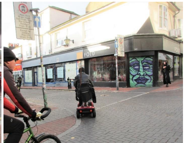
Sydney Street: How do people using mobility vehicles or non-standard cycles manage when the gate is closed?