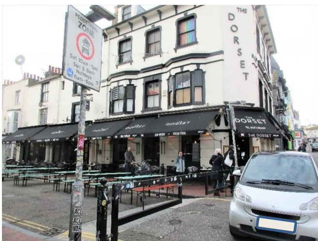
It is legal to cycle southbound along Gardner Street but this gate at the northern end blocks the route.