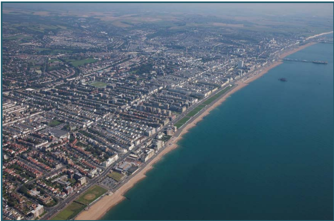
Views over the City of Brighton & Hove