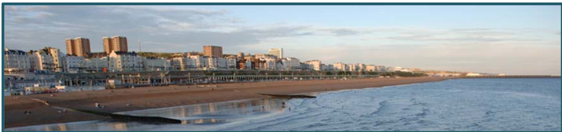
Easterly views towards Marine Parade, Brighton

The charging area covers the administrative area of Brighton and Hove City Council excluding the South Downs National Park area. The National Park Authority is the charging authority for its own CIL Charging Schedule implemented on 1st April 2017.