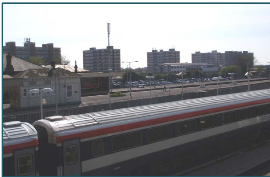
Hove Railway Station, looking west

It is also anticipated that the CIL charging schedule and its rates will be reviewed within a 3 to 5 year time period, from its adoption date, or at an earlier date if changing market conditions support this.