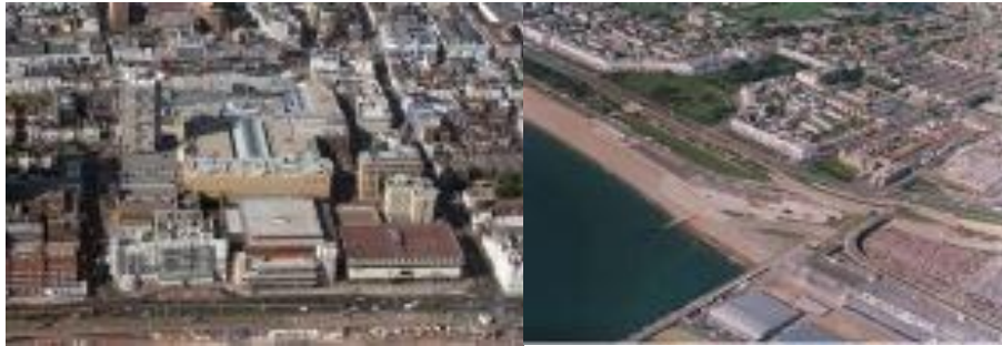
The Brighton Centre and Churchill Square Black Rock