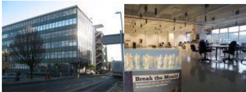
New England House