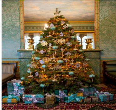
Christmas at the Royal Pavilion

Christmas at the Royal Pavilion: From 16 November to 2 January the Royal Pavilion was decorated for Christmas with schemes inspired by the building and its décor. This year the scheme has been adapted to work with the 'A Prince's Treasure' exhibition. Highlights include a 16ft-tree in the Great Kitchen decorated with copper spoons and pans reflecting the collection of Duke of Wellington's copperware on display. A replica of Queen Victoria's 1845 sleigh, where visitors could dress up and have their photo taken to the sound of traditional music. This was very popular with visitors taking and sharing their own photographs.