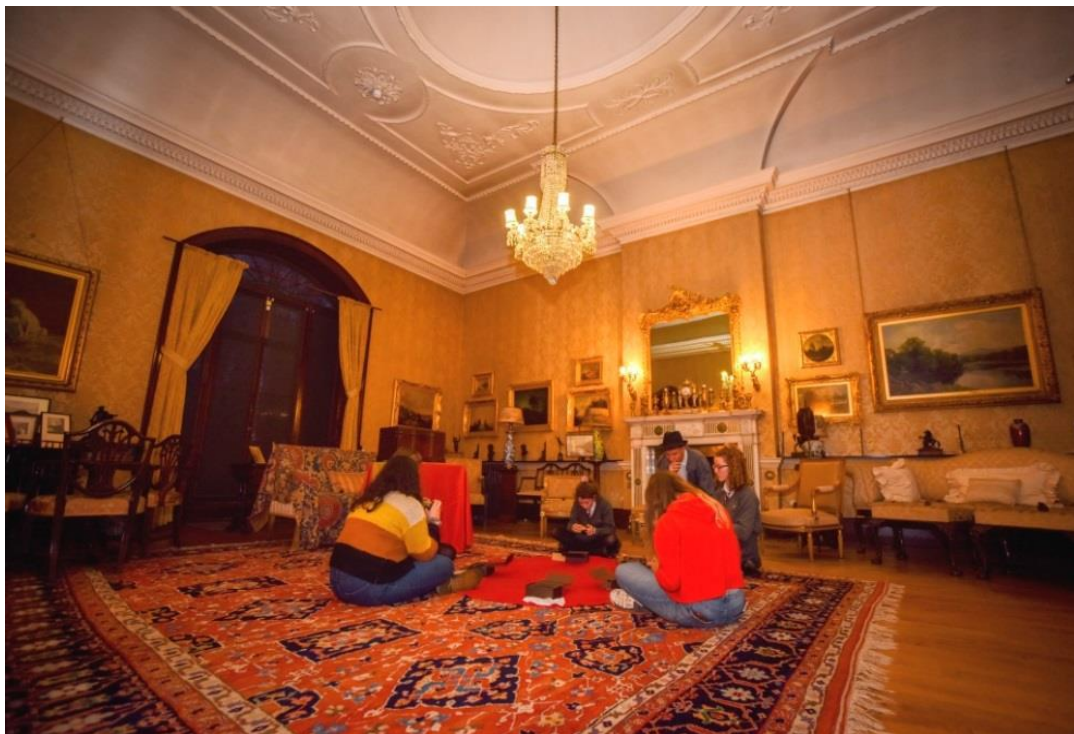
"Escape! Mystery at the Manor"

"So immersive, and it was cool being able to interact with the items, our host and move around the space".