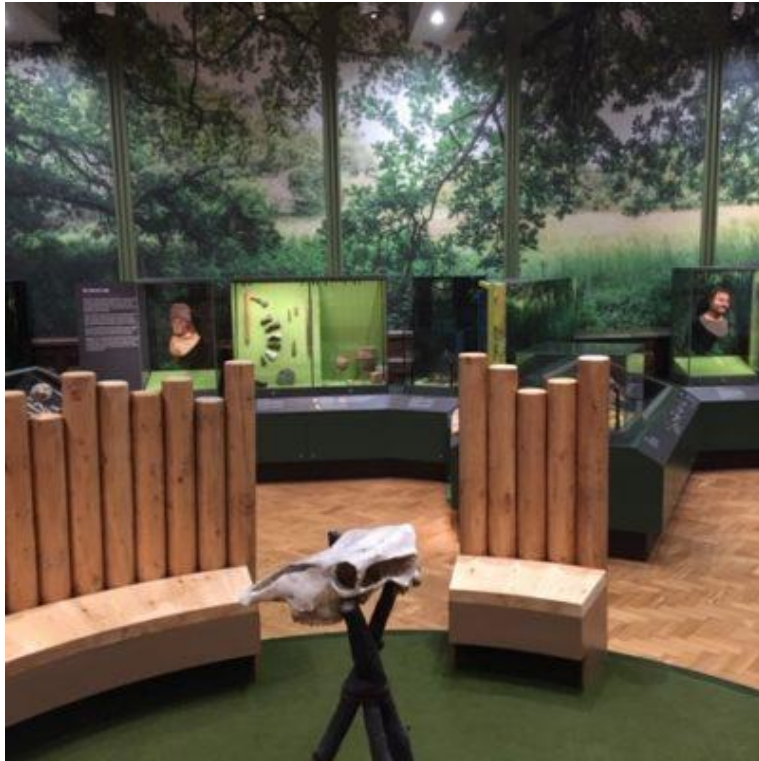
The Elaine Evans Gallery

‘Floating Worlds’ Japanese Woodcuts: An exhibition at Brighton Museum invited visitors to explore the ‘floating worlds’ of Japan through woodblock prints from the Edo period. Guided by haiku poetry the display offered the visitor a journey from the city of Edo to the countryside and mountains of rural Japan. The exhibition was accompanied by a programme of mindful and wellbeing events including meditation, yoga, calligraphy workshops and tai chi, alongside tours and talks. The visitor survey report showed 93% of visitors said the exhibition was good or excellent, 66% describe their visit as calming, 39% as mindful, and 80% agree that visiting the exhibition had impacted positively on their wellbeing.