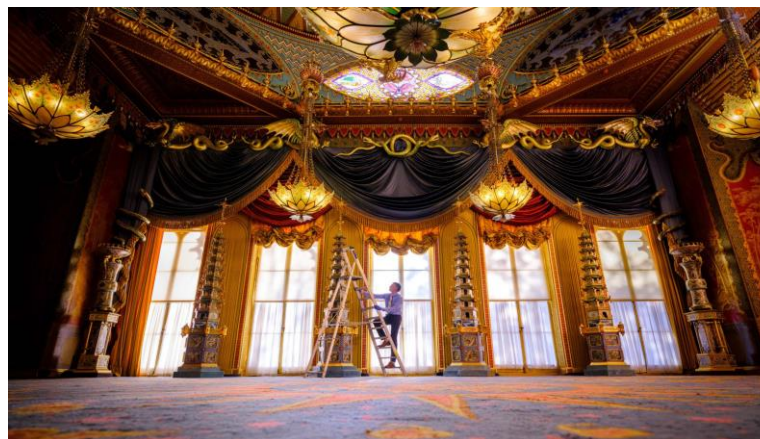
Installing the ceramic pagodas in the Music Room