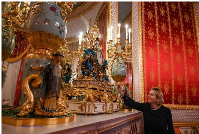
The Kylin Clock and a pair of Chinoiserie Candelabras installed