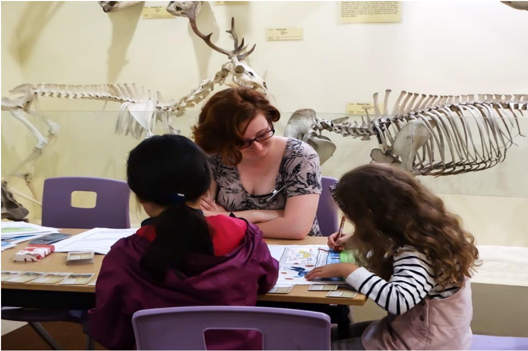
Dying to Survive Discovery Day