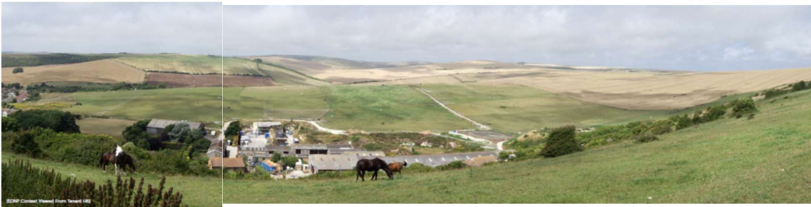
View from Tennant Hill