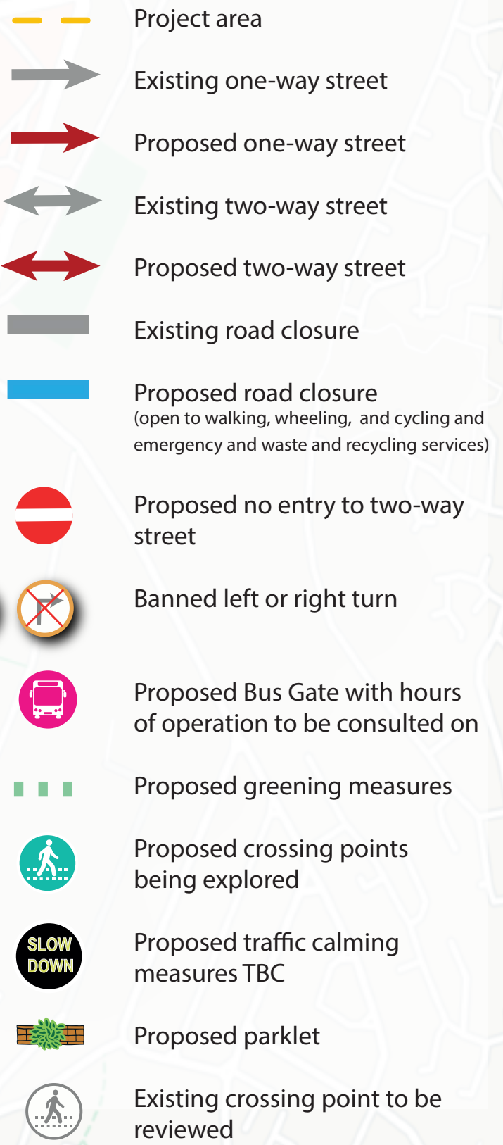
Hanover and Turner Liveable Neighbourhood: Preferred concept plan for public consultation