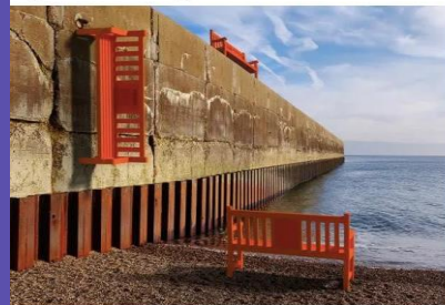
Artwork, part of Brighton's pier-to-pier sound installation

Interactive art in the Pavilion Gardens, dancing in the streets and a pier-to-pier sound installation will span 14 miles of pebbly beachfront from Brighton to Worthing. Brighton's month-long live arts festival is followed by its fringe programme. The festival offers distanced lunchtime concerts at Brighton Dome, an otherworldly night-walk around Shoreham port and a lantern-lit trail with choral music and light sculptures through Stanmer woods at dusk. This year's guest director, the poet Lemn Sissay, has helped schedule nearly 100 shows and installations. One of several world premieres is Tenebrae: Lessons Learnt in Darkness , a moving all-day spectacle inspired by the past year, at Brighton's reopened Theatre Royal. And there's a multi-sensory woodland from mid-May in Olafur Eliasson's immersive The Forked Forest Path under the Fabrica gallery's Regency church beams, and a fake-news-era War of the Worlds at Worthing theatre.