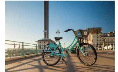
Grand Brighton Bike Tour, £29.99, Get Your Guide

The best way to explore a city? By bike of course! Experience Brighton on two wheels on a leisurely 2.5-hour guided cycling tour, allowing you to explore the artistic back streets of the North Laines, the flamboyant architecture of the Royal Pavilion, quaint Fishing Quarter, Georgian architecture of Brunswick Square, and more.