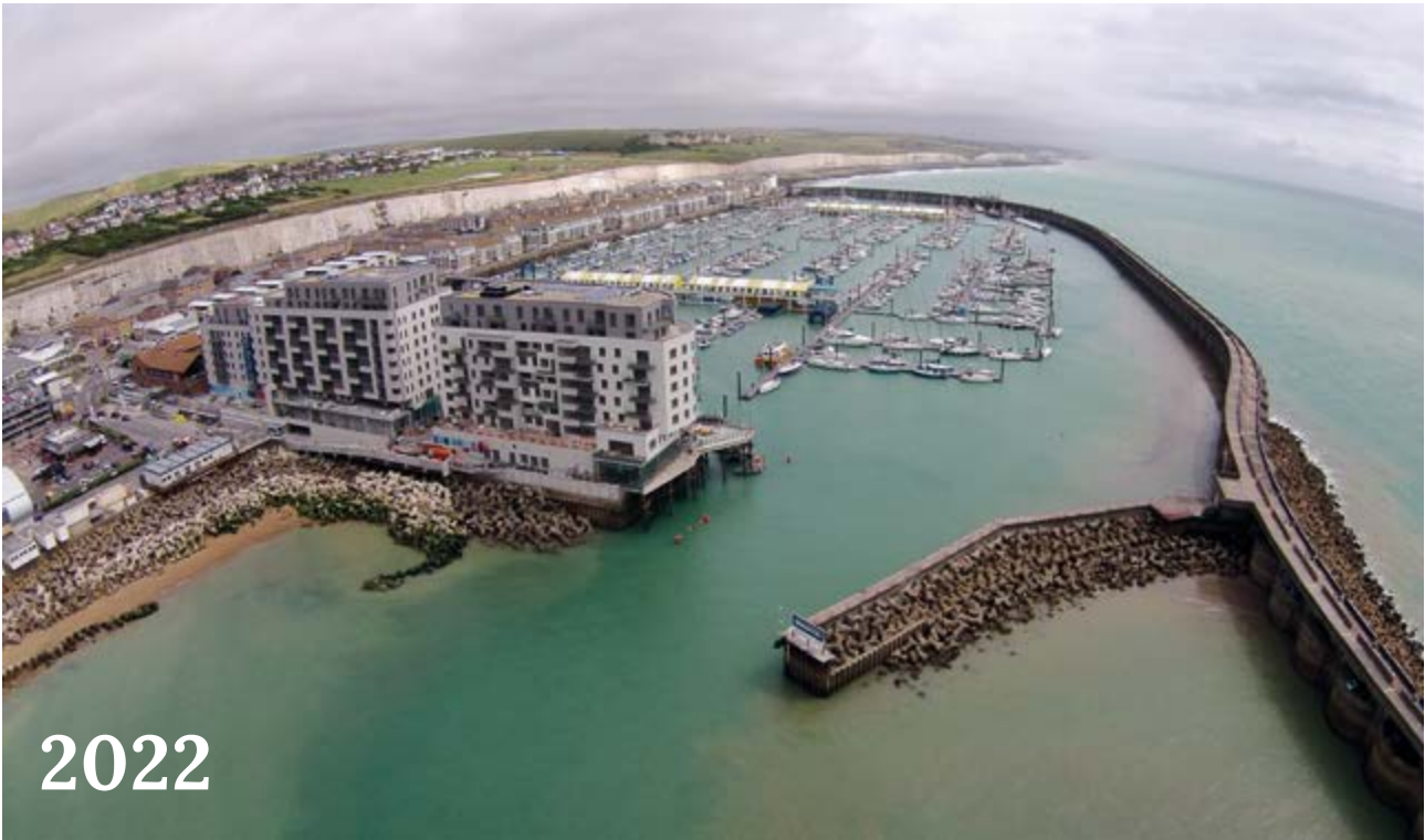
25 years of development progress at Brighton Marina